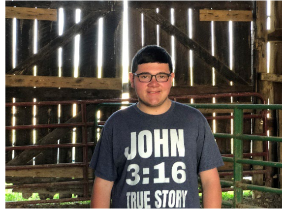
WILL POSING IN ONE OF HIS FAVORITE PLACES - THE FARM.

Will knows exactly where he's going to be.